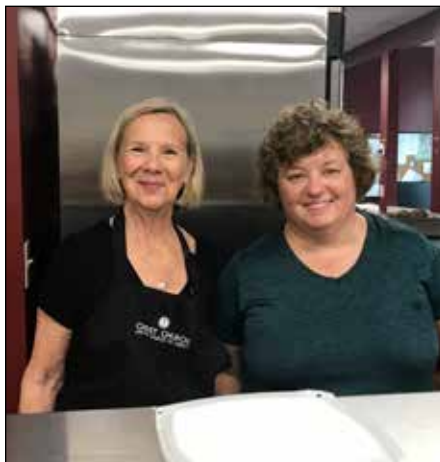
Just a few of our Hosea House volunteers.