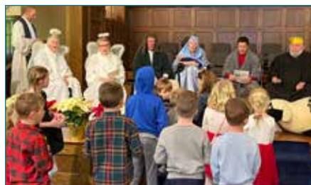
Christmas Eve noon service – Important visitors taking questions from our children