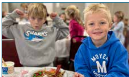
Making gingerbread churches during Sunday School