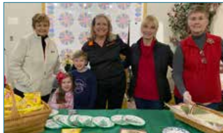
A few of the volunteers at the Holiday Walk