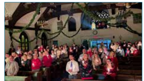
Our Christmas Eve late service