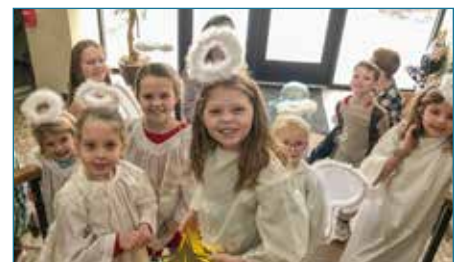
Our children's service – telling the story of Christ's birth