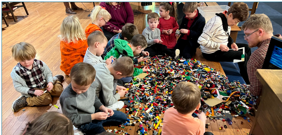
Our children enjoying Legos during the January 29 service