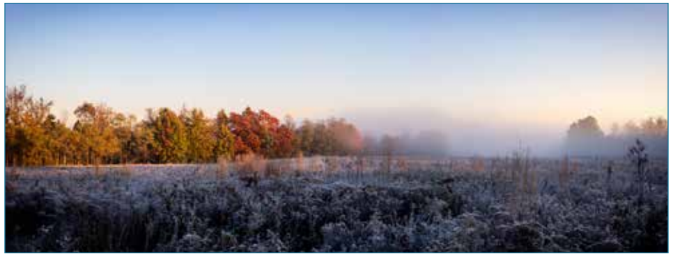
Pastor Ed's photo was recently chosen to be in a photography exhibit at Cincinnati Nature Center and was used in their promotional materials.