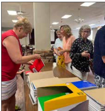
Our volunteers assembling back-to-school kits.