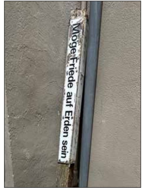
Our old pole after many years of service.