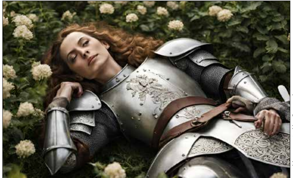
graphic generated by Canva ai