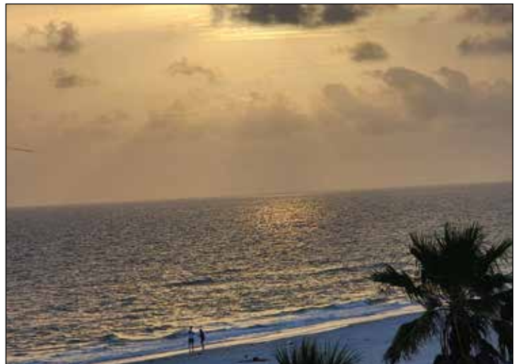
The Vogels went to Madeira Beach, Florida