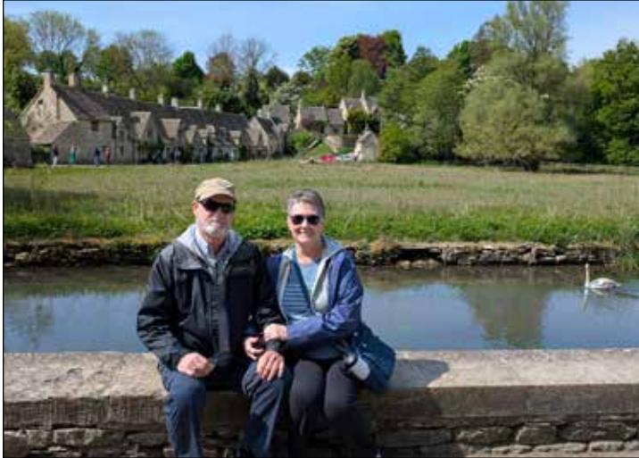
The Stinsons were in England, Denmark, and Norway