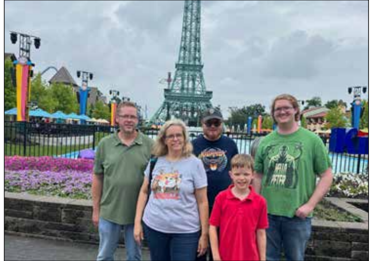
The Borahs had a "staycation" at Kings Island